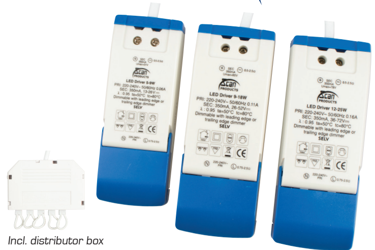
Incl. distributor box